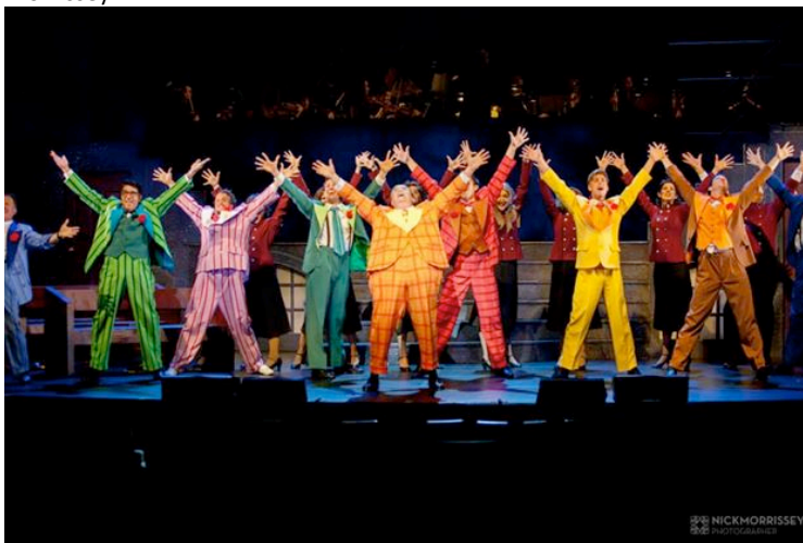
Cast of GUYS & DOLLS in Sit Down You're Rocking The Boat.